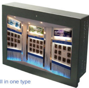
All in one type

Information Kiosk, POS, Mobile solution, Automation control